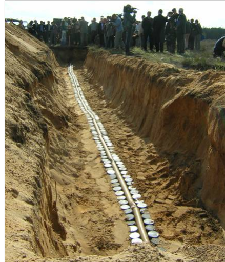
Stockpiled anti-personnel mines can be destroyed by open detonation, a method used by Lithuania in advance of the First Review Conference in 2004.